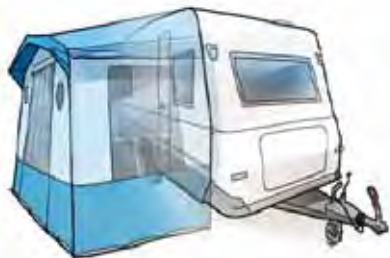
Examples of camping units.